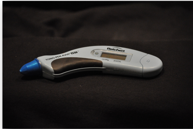
Clear view from a normal eye.

● Diabetes Mellitus. Dogs with diabetes mellitus store glucose byproducts in their lens which can rapidly cause a cataract to form. This type of cataract can occasionally cause severe inflammation in the eye requiring rapid removal to avoid permanent vision loss.